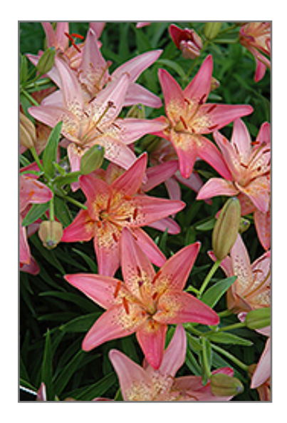
Pink Pixie Lily flowers

Pink Pixie Lily features bold pink trumpet-shaped flowers with yellow throats and purple tips at the ends of the stems in early summer. The flowers are excellent for cutting. Its narrow leaves remain green in color throughout the season.