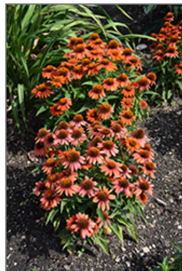
Sombrero Adobe Orange Coneflower in bloom