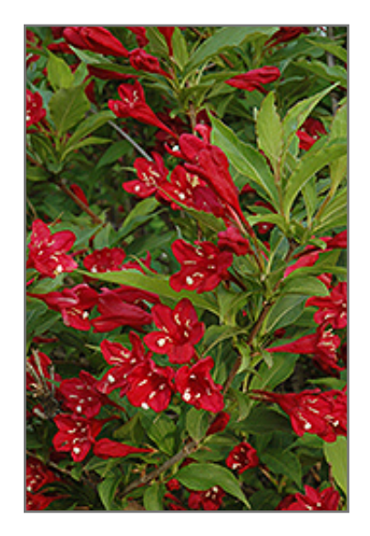
Red Prince Weigela flowers

This shrub will require occasional maintenance and upkeep, and should only be pruned after flowering to avoid removing any of the current season's flowers. It is a good choice for attracting hummingbirds to your yard. It has no significant negative characteristics.