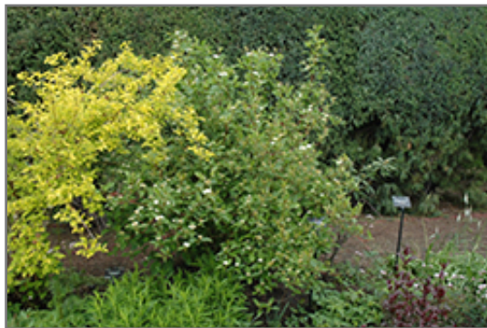
Red Osier Dogwood

This shrub does best in full sun to partial shade. It is an amazingly adaptable plant, tolerating both dry conditions and even some standing water. It is not particular as to soil type or pH. It is highly tolerant of urban pollution and will even thrive in inner city environments. This species is native to parts of North America.