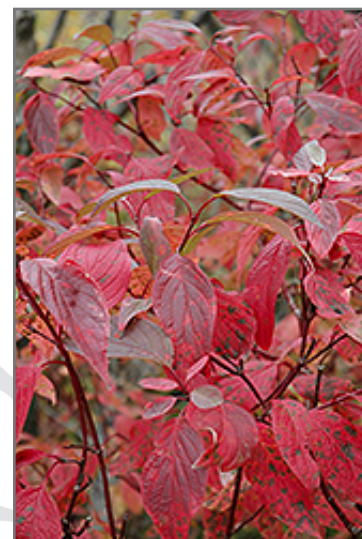
Red Osier Dogwood in fall