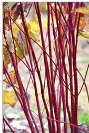
Red Osier Dogwood stems