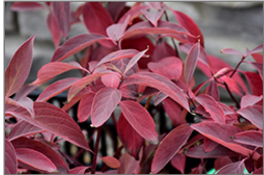
Arctic Fire Dogwood in fall

This shrub does best in full sun to partial shade. It is an amazingly adaptable plant, tolerating both dry conditions and even some standing water. It is not particular as to soil type or pH. It is highly tolerant of urban pollution and will even thrive in inner city environments. This is a selection of a native North American species.