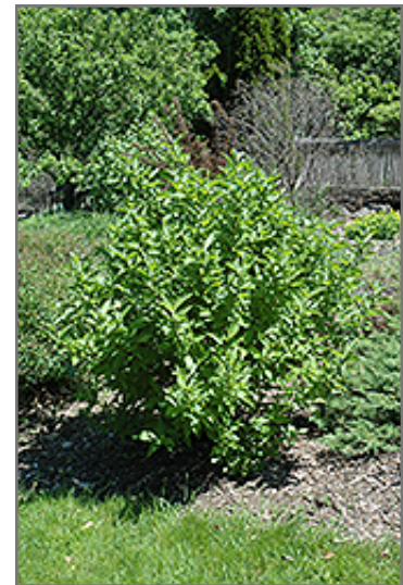
Arctic Fire Dogwood