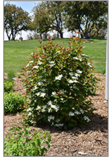
Redwing Viburnum in bloom

Redwing Viburnum is a dense multi-stemmed deciduous shrub with an upright spreading habit of growth. Its average texture blends into the landscape, but can be balanced by one or two finer or coarser trees or shrubs for an effective composition.