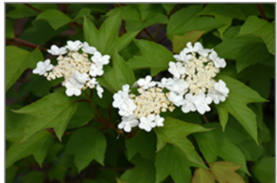
Redwing Viburnum flowers