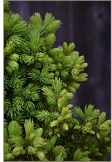
Rainbow's End Spruce foliage

This shrub does best in full sun to partial shade. It prefers to grow in average to moist conditions, and shouldn't be allowed to dry out. It is not particular as to soil type or pH. It is somewhat tolerant of urban pollution, and will benefit from being planted in a relatively sheltered location. This is a selection of a native North American species.