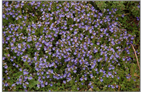
Turkish Speedwell in bloom

This is a relatively low maintenance plant, and should only be pruned after flowering to avoid removing any of the current season's flowers. It is a good choice for attracting butterflies to your yard, but is not particularly attractive to deer who tend to leave it alone in favor of tastier treats. It has no significant negative characteristics.