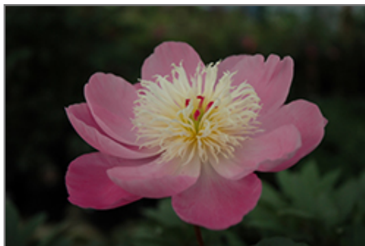
Edulis Superba Peony flowers