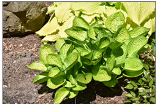
Rainforest Sunrise Hosta