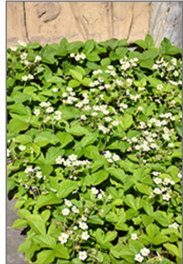
Common Wild Strawberry in bloom

Common Wild Strawberry features dainty white cup-shaped flowers with yellow eyes along the stems from late spring to early summer. Its attractive tomentose round compound leaves remain green in colour throughout the season. It features an abundance of magnificent cherry red berries from late spring to late summer.