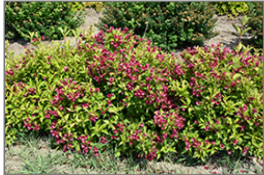
Ghost Weigela in bloom

This shrub should only be grown in full sunlight. It prefers to grow in average to moist conditions, and shouldn't be allowed to dry out. It is not particular as to soil type or pH. It is highly tolerant of urban pollution and will even thrive in inner city environments. This is a selected variety of a species not originally from North America.