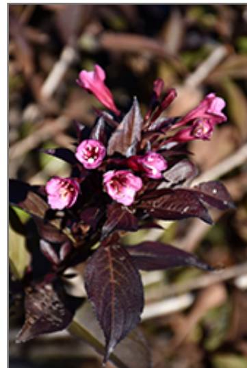
Fine Wine Weigela flowers