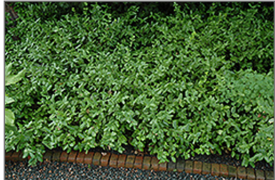
Sarcoxie Wintercreeper

This shrub performs well in both full sun and full shade. It is very adaptable to both dry and moist locations, and should do just fine under average home landscape conditions. It is not particular as to soil type or pH. It is highly tolerant of urban pollution and will even thrive in inner city environments, and will benefit from being planted in a relatively sheltered location. This is a selected variety of a species not originally from North America.