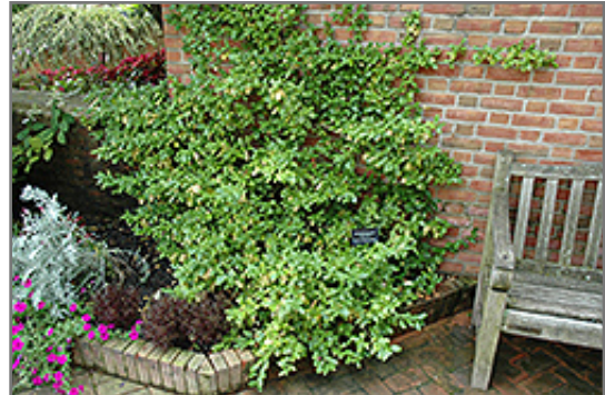
Sarcoxie Wintercreeper