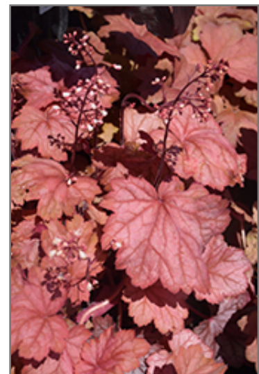
Georgia Peach Coral Bells in bloom