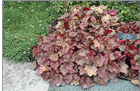
Georgia Peach Coral Bells