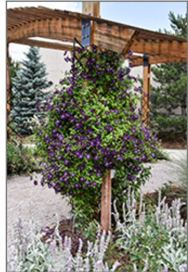
Jackmanii Superba Clematis in bloom

Jackmanii Superba Clematis makes a fine choice for the outdoor landscape, but it is also well-suited for use in outdoor pots and containers. Because of its spreading habit of growth, it is ideally suited for use as a 'spiller' in the 'spiller-thriller-filler' container combination; plant it near the edges where it can spill gracefully over the pot. It is even sizeable enough that it can be grown alone in a suitable container. Note that when grown in a container, it may not perform exactly as indicated on the tag - this is to be expected. Also note that when growing plants in outdoor containers and baskets, they may require more frequent waterings than they would in the yard or garden. Be aware that in our climate, most plants cannot be expected to survive the winter if left in containers outdoors, and this plant is no exception. Contact our experts for more information on how to protect it over the winter months.