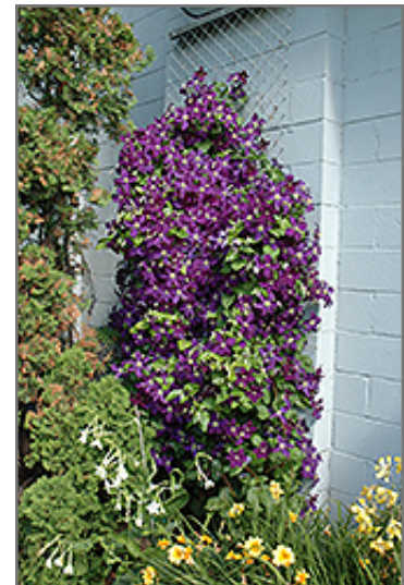
Jackmanii Superba Clematis in bloom