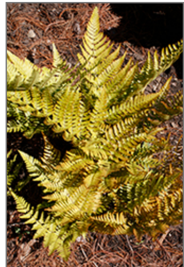
Brilliance Autumn Fern in fall