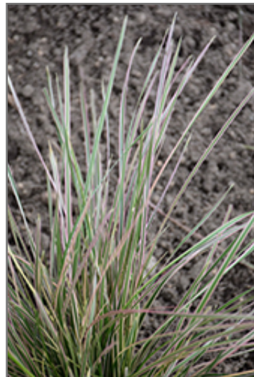
Northern Lights Tufted Hair Grass foliage