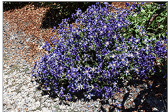
Sapphire Indigo Clematis in bloom