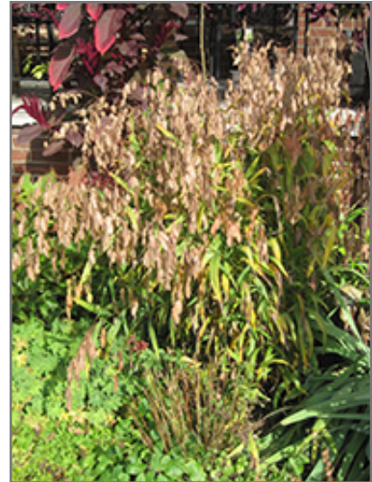
Northern Sea Oats

Northern Sea Oats is a fine choice for the garden, but it is also a good selection for planting in outdoor pots and containers. Because of its height, it is often used as a 'thriller' in the 'spiller-thriller-filler' container combination; plant it near the center of the pot, surrounded by smaller plants and those that spill over the edges. It is even sizeable enough that it can be grown alone in a suitable container. Note that when growing plants in outdoor containers and baskets, they may require more frequent waterings than they would in the yard or garden. Be aware that in our climate, most plants cannot be expected to survive the winter if left in containers outdoors, and this plant is no exception. Contact our experts for more information on how to protect it over the winter months.