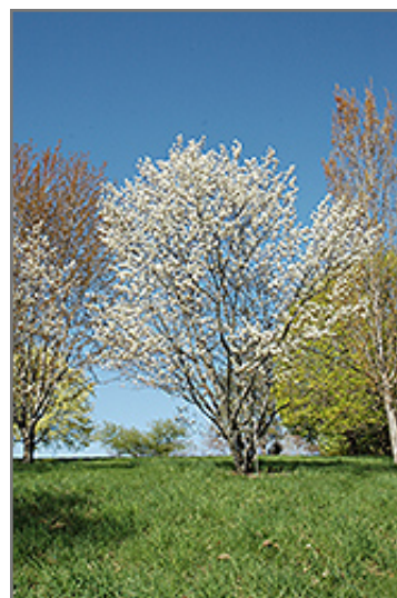
Princess Diana Serviceberry in bloom

Princess Diana Serviceberry will grow to be about 20 feet tall at maturity, with a spread of 15 feet. It has a low canopy with a typical clearance of 4 feet from the ground, and is suitable for planting under power lines. It grows at a medium rate, and under ideal conditions can be expected to live for 40 years or more.