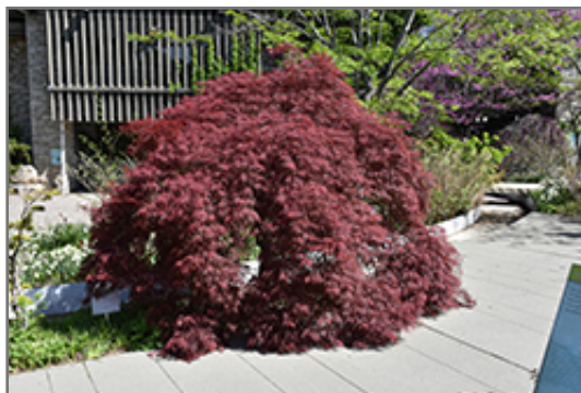
Inaba Shidare Cutleaf Japanese Maple