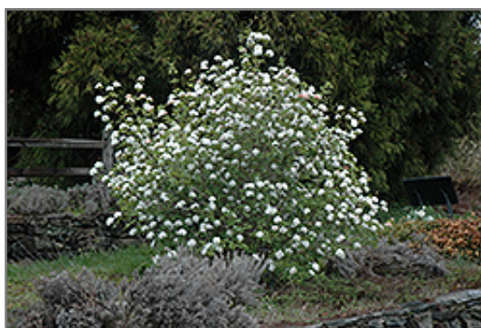
Koreanspice Viburnum in bloom