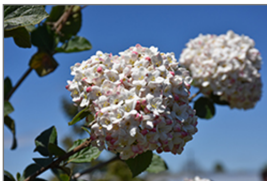
Koreanspice Viburnum flowers

Koreanspice Viburnum is recommended for the following landscape applications;