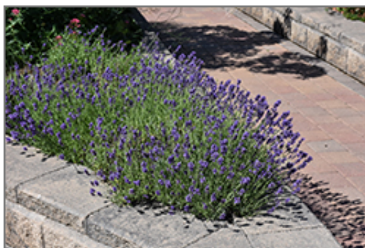
Munstead Lavender in bloom