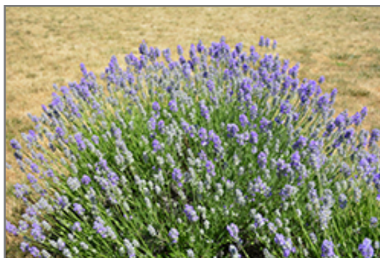
Munstead Lavender in bloom