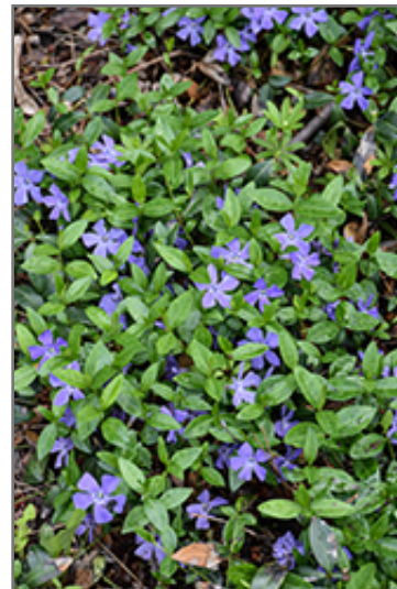
Common Periwinkle flowers