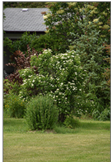
Arrowwood in bloom