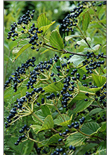
Arrowwood fruit