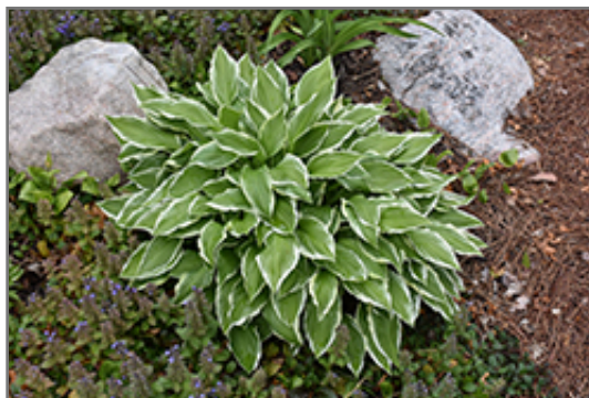
Golden Variegated Hosta