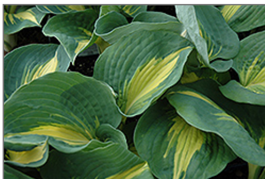
Thunderbolt Hosta foliage