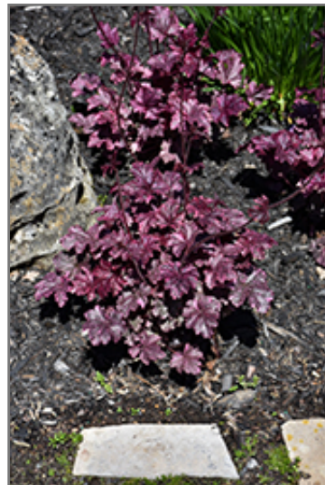
Midnight Rose Coral Bells