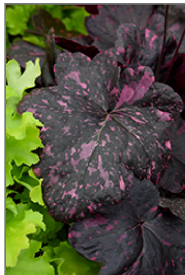
Midnight Rose Coral Bells foliage