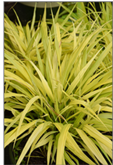
All Gold Hakone Grass foliage