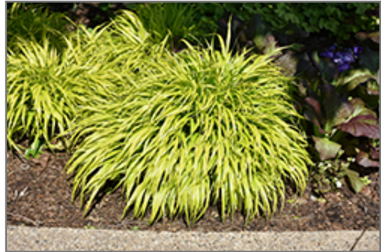
All Gold Hakone Grass