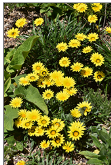
Colorado Gold Gazania flowers

Colorado Gold Gazania is a fine choice for the garden, but it is also a good selection for planting in outdoor pots and containers. Because of its spreading habit of growth, it is ideally suited for use as a 'spiller' in the 'spiller-thriller-filler' container combination; plant it near the edges where it can spill gracefully over the pot. Note that when growing plants in outdoor containers and baskets, they may require more frequent waterings than they would in the yard or garden. Be aware that in our climate, most plants cannot be expected to survive the winter if left in containers outdoors, and this plant is no exception. Contact our experts for more information on how to protect it over the winter months.