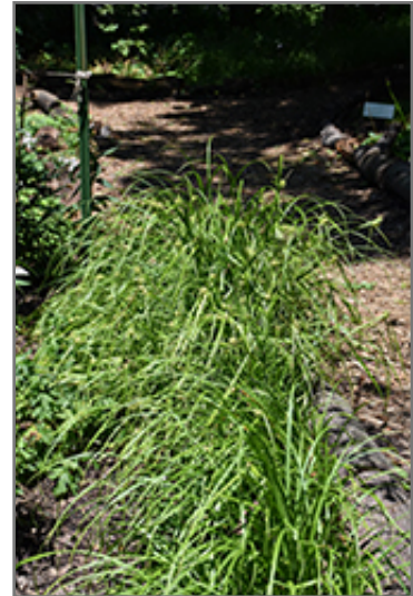
Gray's Sedge

Gray's Sedge is a fine choice for the garden, but it is also a good selection for planting in outdoor pots and containers. With its upright habit of growth, it is best suited for use as a 'thriller' in the 'spiller-thriller-filler' container combination; plant it near the center of the pot, surrounded by smaller plants and those that spill over the edges. It is even sizeable enough that it can be grown alone in a suitable container. Note that when growing plants in outdoor containers and baskets, they may require more frequent waterings than they would in the yard or garden. Be aware that in our climate, most plants cannot be expected to survive the winter if left in containers outdoors, and this plant is no exception. Contact our experts for more information on how to protect it over the winter months.