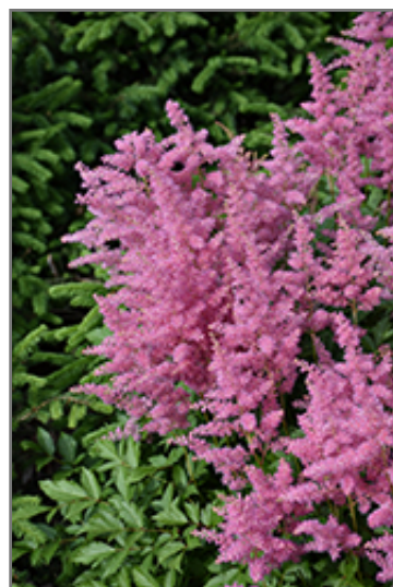
Visions in Pink Chinese Astilbe flowers