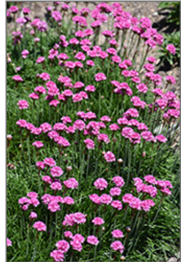
Bloodstone Sea Thrift in bloom

Bloodstone Sea Thrift is a fine choice for the garden, but it is also a good selection for planting in outdoor pots and containers. It is often used as a 'filler' in the 'spiller-thriller-filler' container combination, providing a mass of flowers against which the thriller plants stand out. Note that when growing plants in outdoor containers and baskets, they may require more frequent waterings than they would in the yard or garden. Be aware that in our climate, most plants cannot be expected to survive the winter if left in containers outdoors, and this plant is no exception. Contact our experts for more information on how to protect it over the winter months.