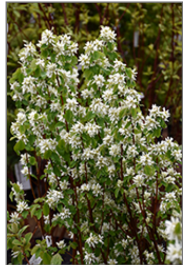
Standing Ovation Saskatoon Berry flowers