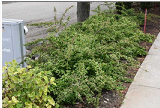
Jolene Jolene Beautybush