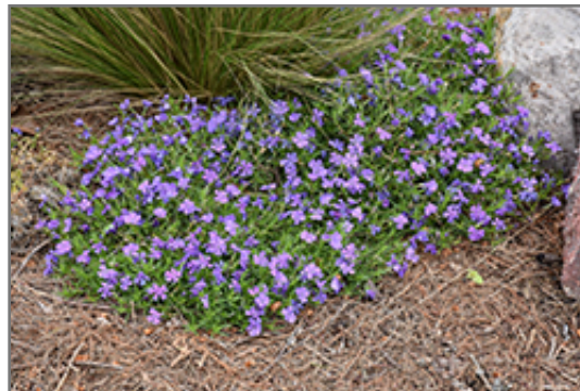
Rocky Road Violet Blue Phlox in bloom