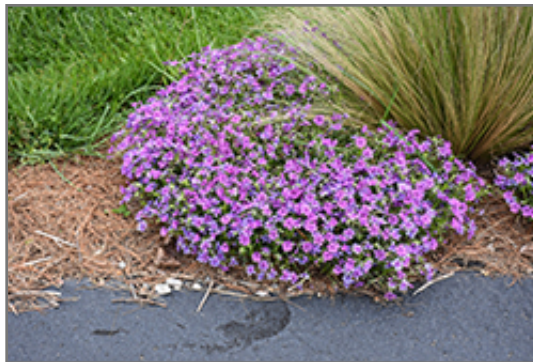
Rocky Road Grape Phlox in bloom