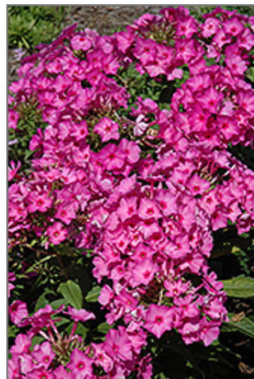
Flame Pink Garden Phlox flowers