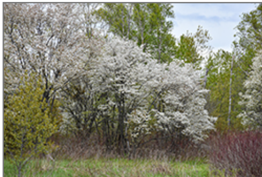
Allegheny Serviceberry in bloom