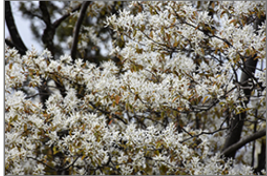
Allegheny Serviceberry flowers

This tree does best in full sun to partial shade. It prefers to grow in average to moist conditions, and shouldn't be allowed to dry out. It is not particular as to soil type or pH. It is somewhat tolerant of urban pollution. This species is native to parts of North America.