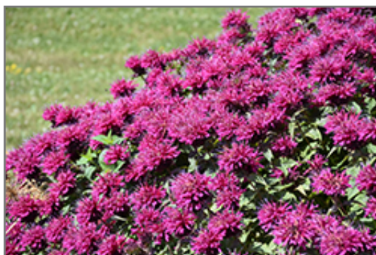
Grand Marshall Beebalm flowers