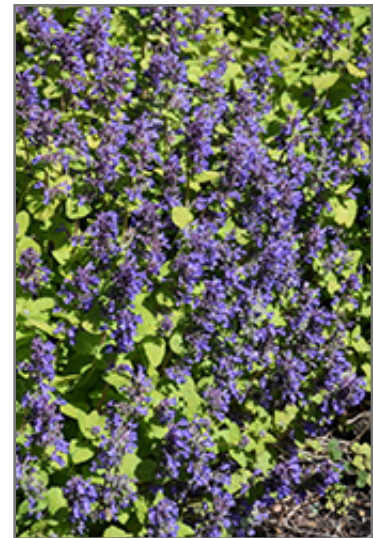
Chartreuse On The Loose Catmint flowers