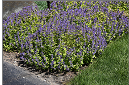
Chartreuse On The Loose Catmint in bloom

Chartreuse On The Loose Catmint is recommended for the following landscape applications;