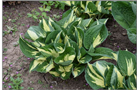
Pathfinder Hosta