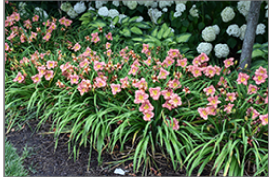
Happy Ever Appster Rosy Returns Daylily in bloom

Happy Ever Appster Rosy Returns Daylily is a fine choice for the garden, but it is also a good selection for planting in outdoor pots and containers. It is often used as a 'filler' in the 'spiller-thriller-filler' container combination, providing a mass of flowers against which the thriller plants stand out. Note that when growing plants in outdoor containers and baskets, they may require more frequent waterings than they would in the yard or garden. Be aware that in our climate, most plants cannot be expected to survive the winter if left in containers outdoors, and this plant is no exception. Contact our experts for more information on how to protect it over the winter months.