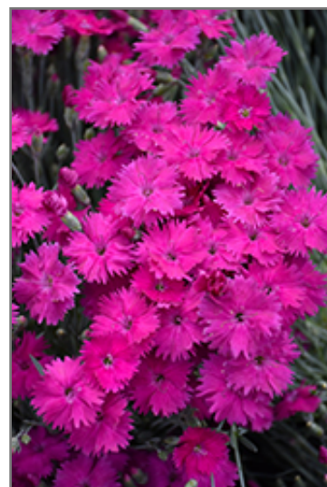
Neon Star Pinks flowers

Neon Star Pinks is recommended for the following landscape applications;