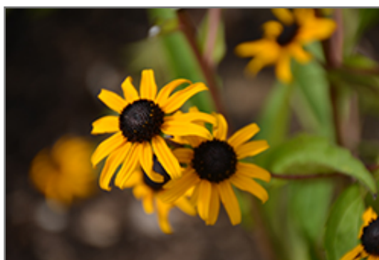
Goldblitz Coneflower flowers