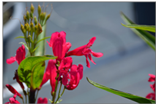
Pristine Deep Rose Beardtongue flowers