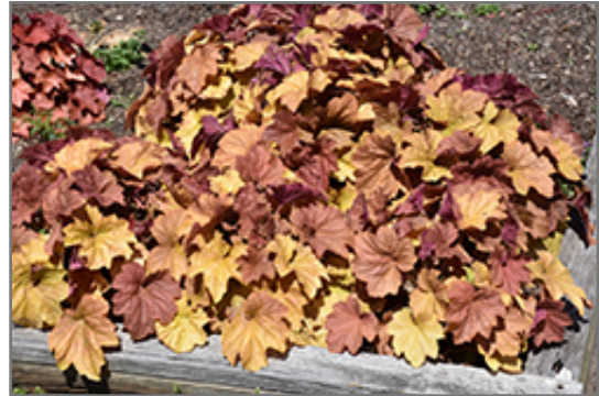
Big Top Caramel Apple Coral Bells

Big Top Caramel Apple Coral Bells is recommended for the following landscape applications;