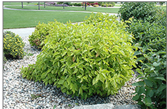
Prairie Fire Dogwood