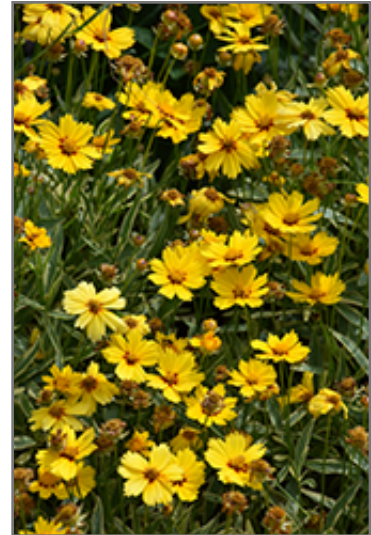
Tequila Sunrise Tickseed flowers